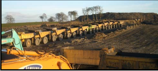
Plate 2: Earthmoving operations.

Following completion of the mining operation, the resulting holes are backfilled with the overburden materials spread in layers of up to 1.2 m in thickness.