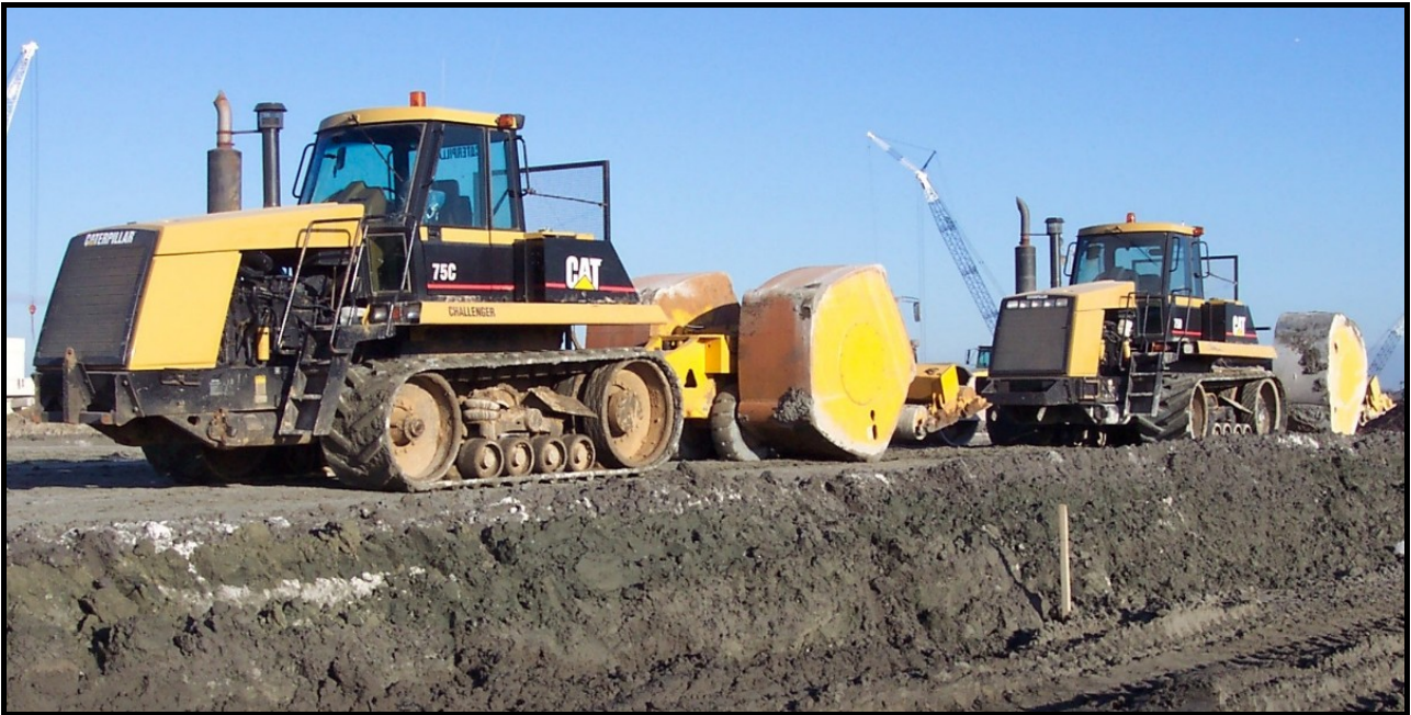
Plate 4 LANDPAC 3 & 5 Sided HEICs

Following completion of the mining operation, the resulting holes are backfilled with the overburden materials spread in layers of up to 1.2 m in thickness.