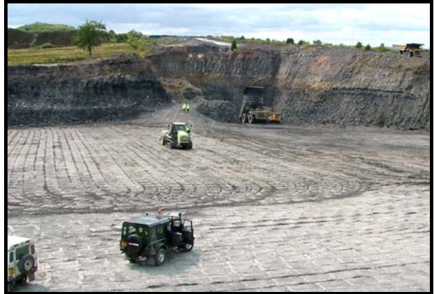
Plate 3 HEIC works and backfilling

The layers are then compacted using either LANDPACs 3 sided or 5 sided HEIC unit.